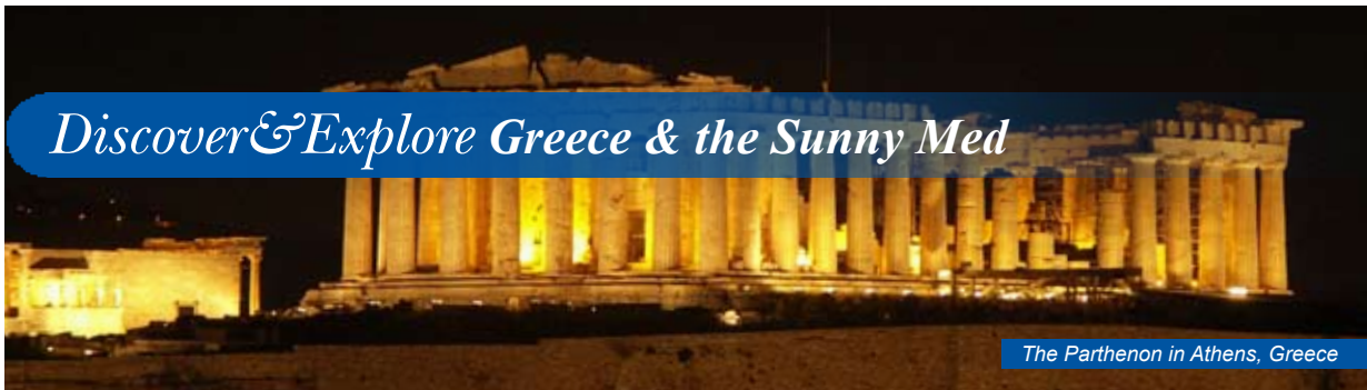
The Parthenon in Athens, Greece